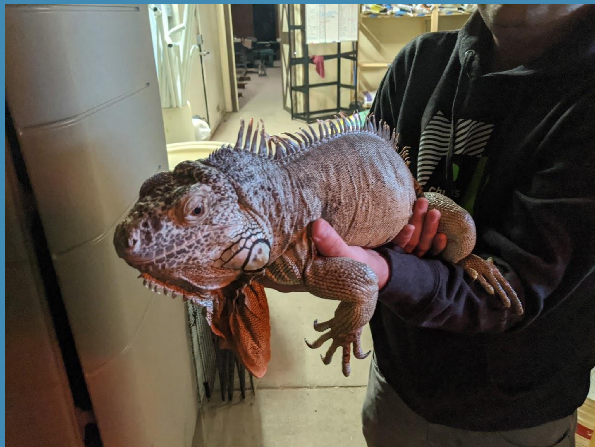
Proper handling practices for larger reptiles on "Gojira"