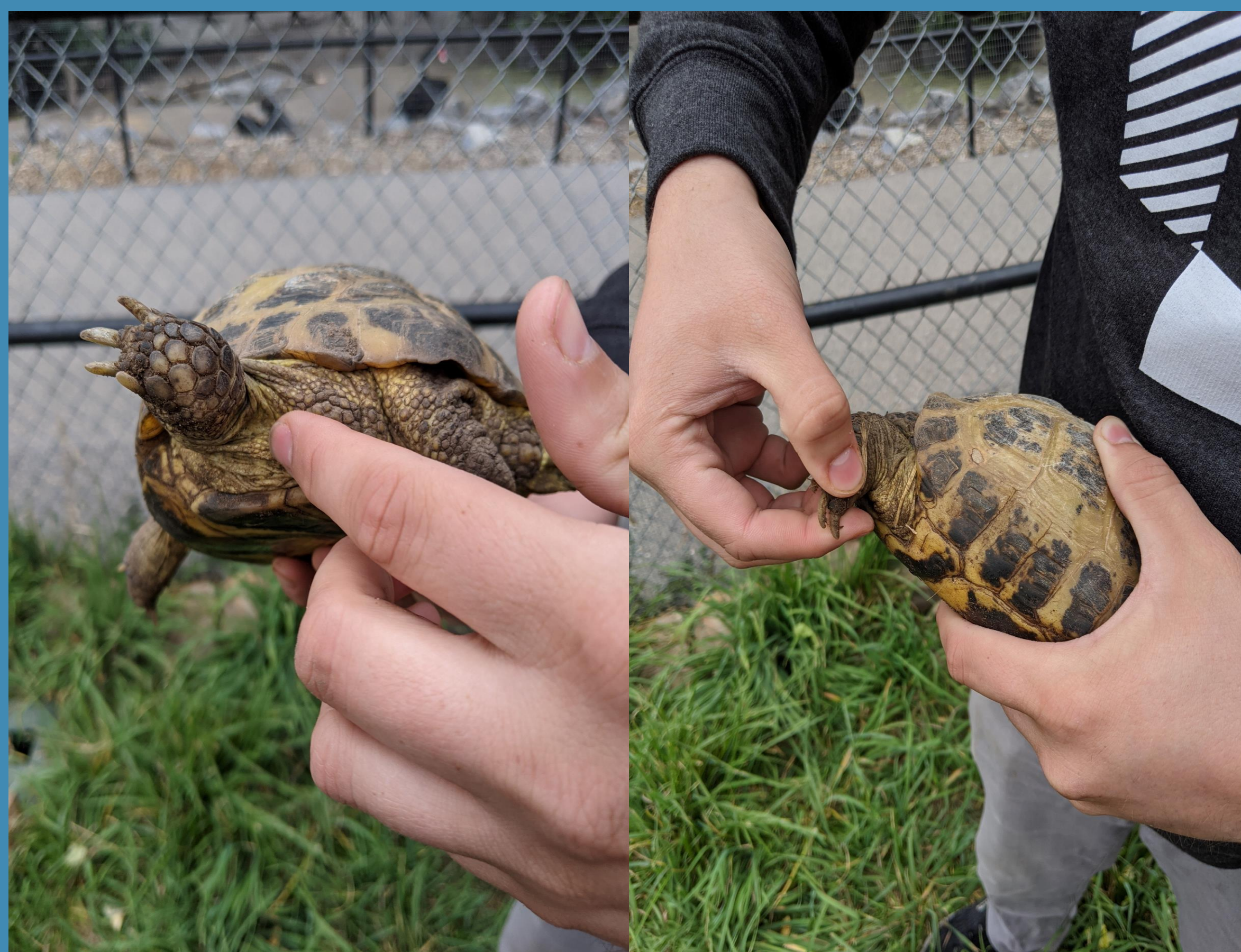
How and where to administer medical shots on a Russian tortoise