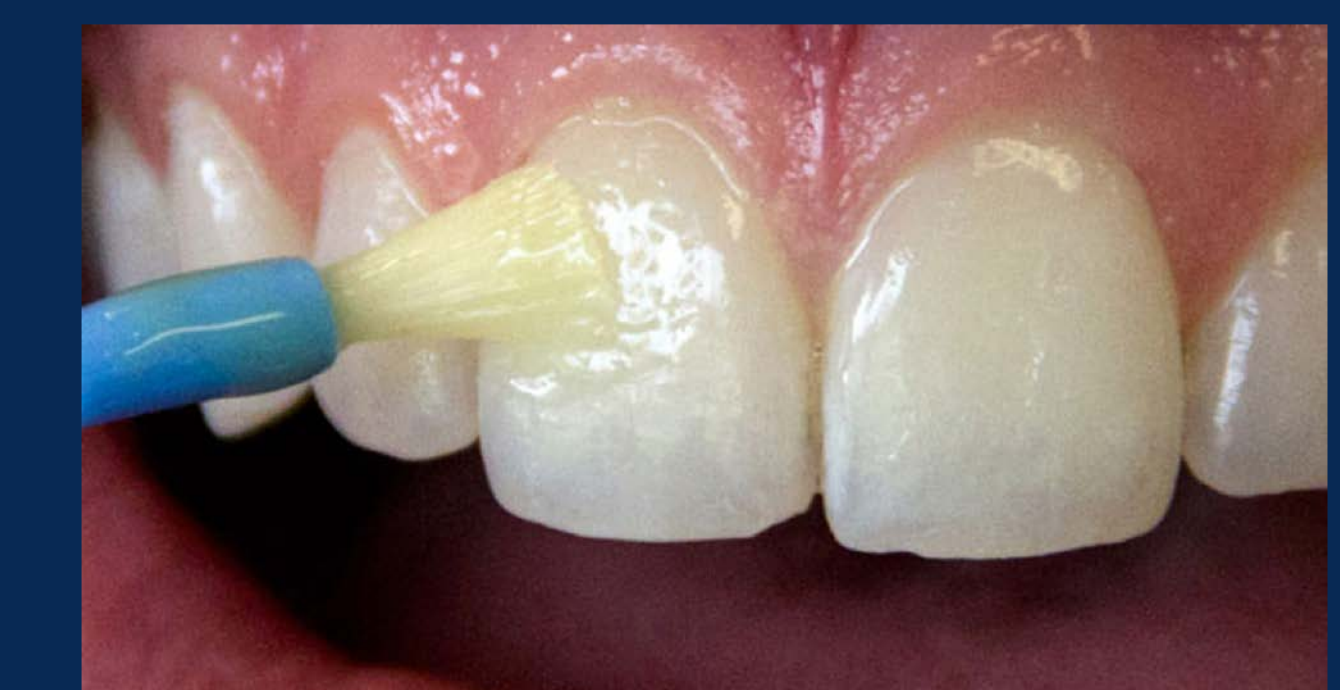
On top is a prophylaxis polish treatment Bottom is application of fluoride