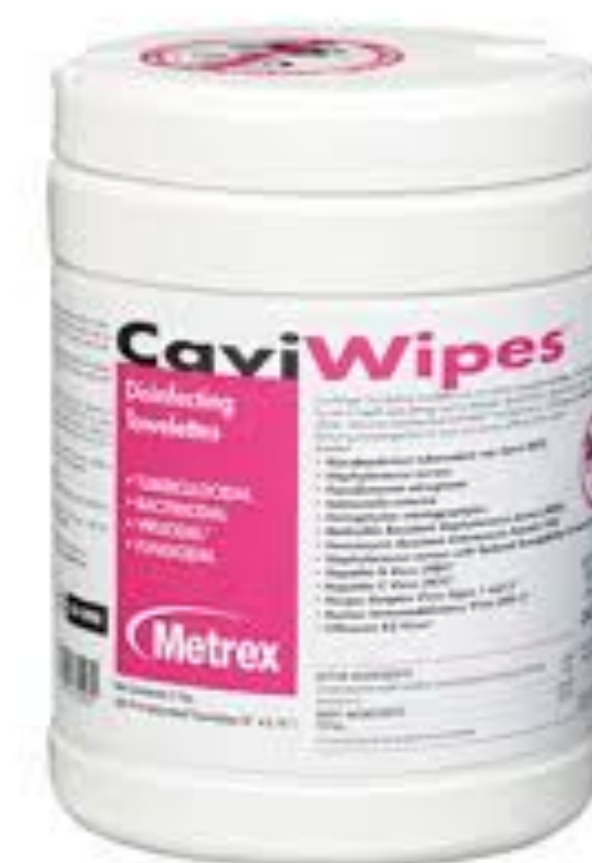
Figure 1 – Different Sterilization Techniques (Antibacterial Wipes and Autoclave)