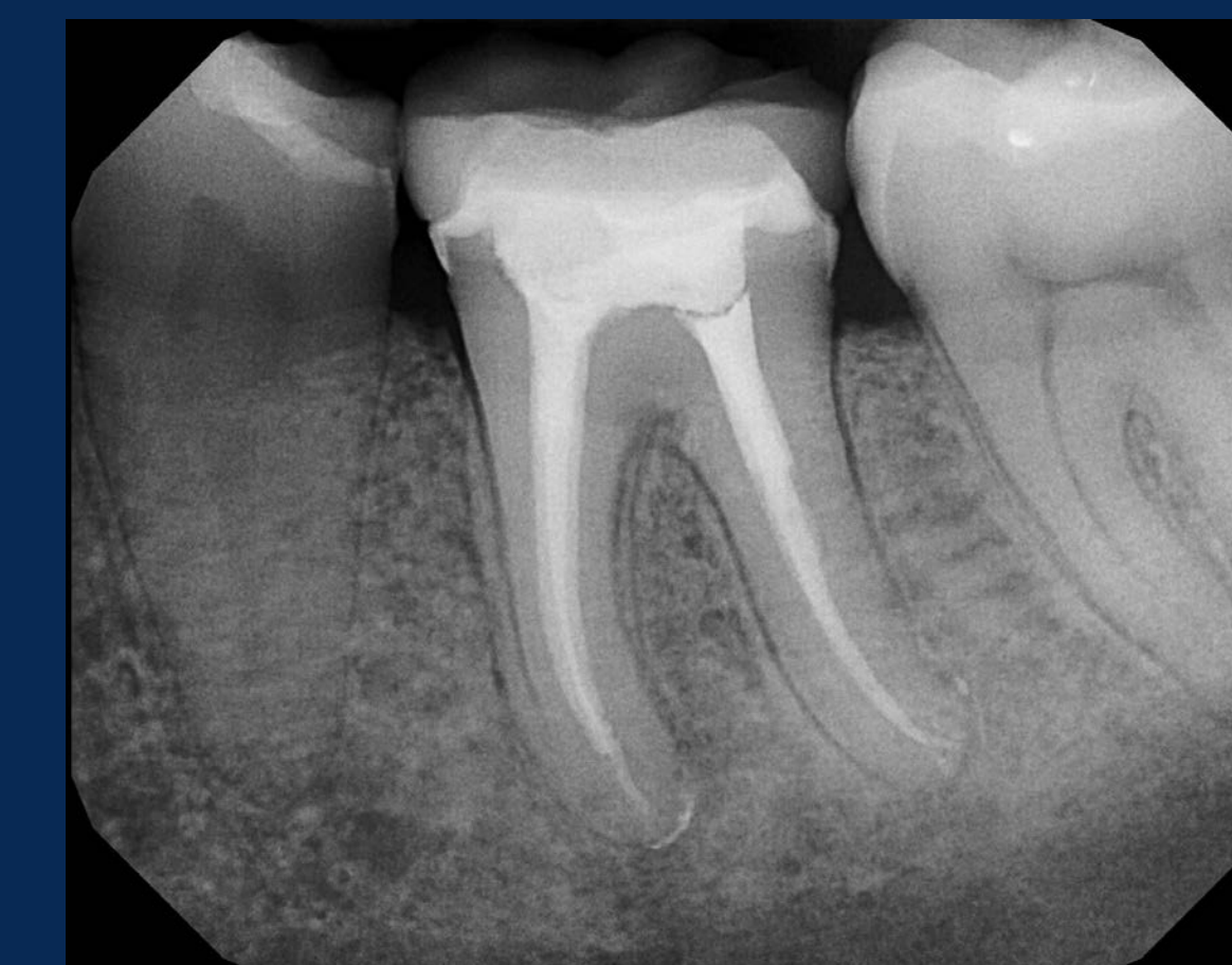
On the left are a set of Bitewing radiographs and on the right is a periapical x-ray of a tooth that has recently done a root canal.