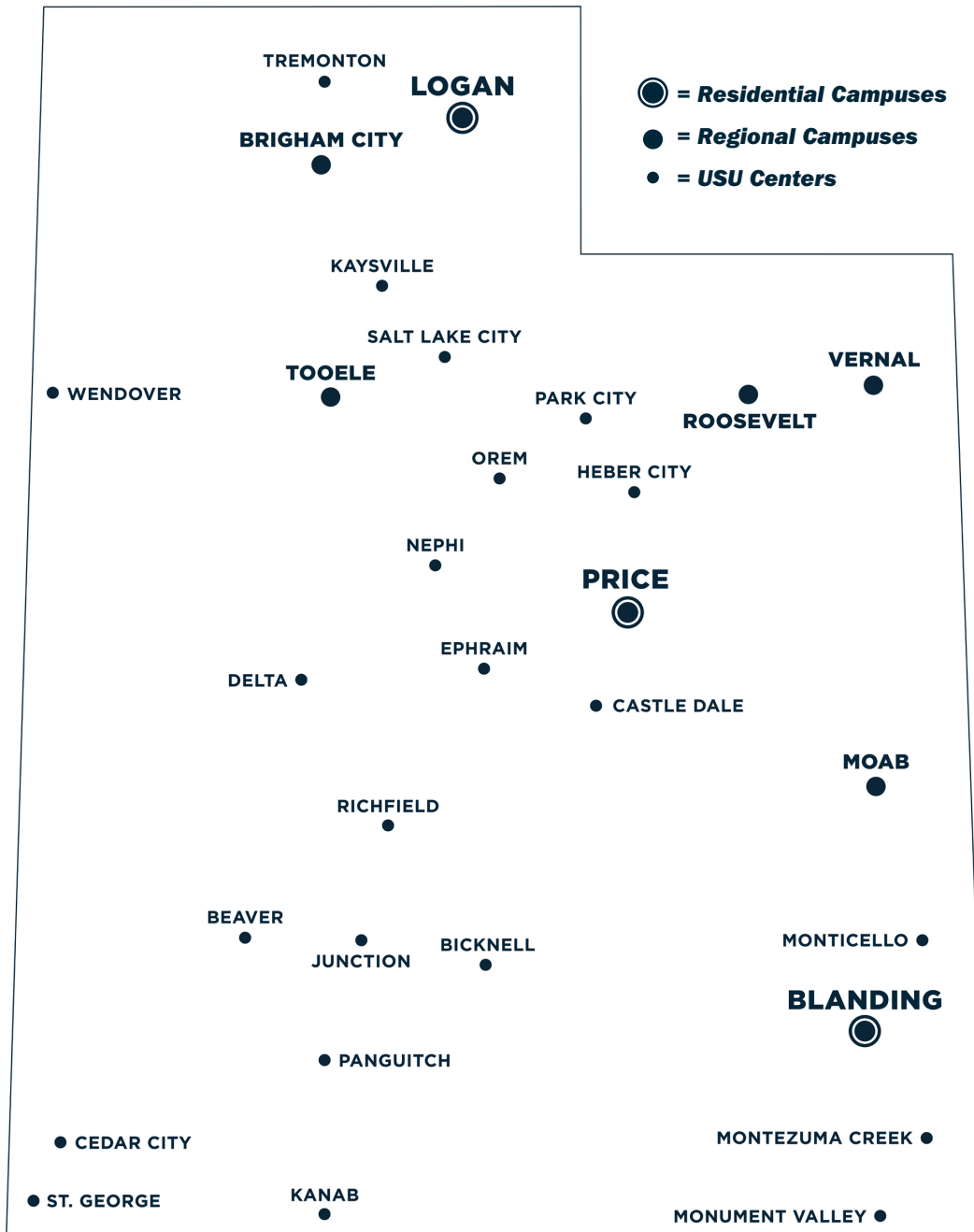
Map of Utah State University locations. Not all sites are separate campuses.