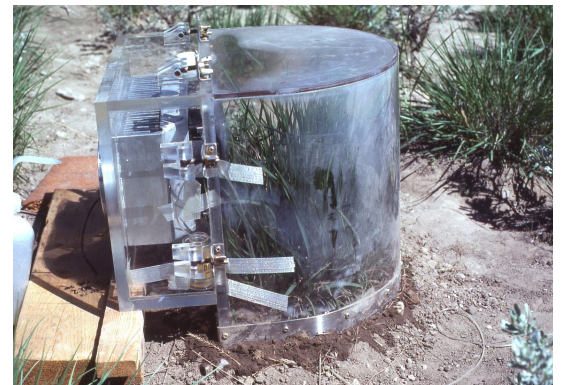
Left - Railroad track for rainout shelter. Top - Cuvette invented by Martyn.