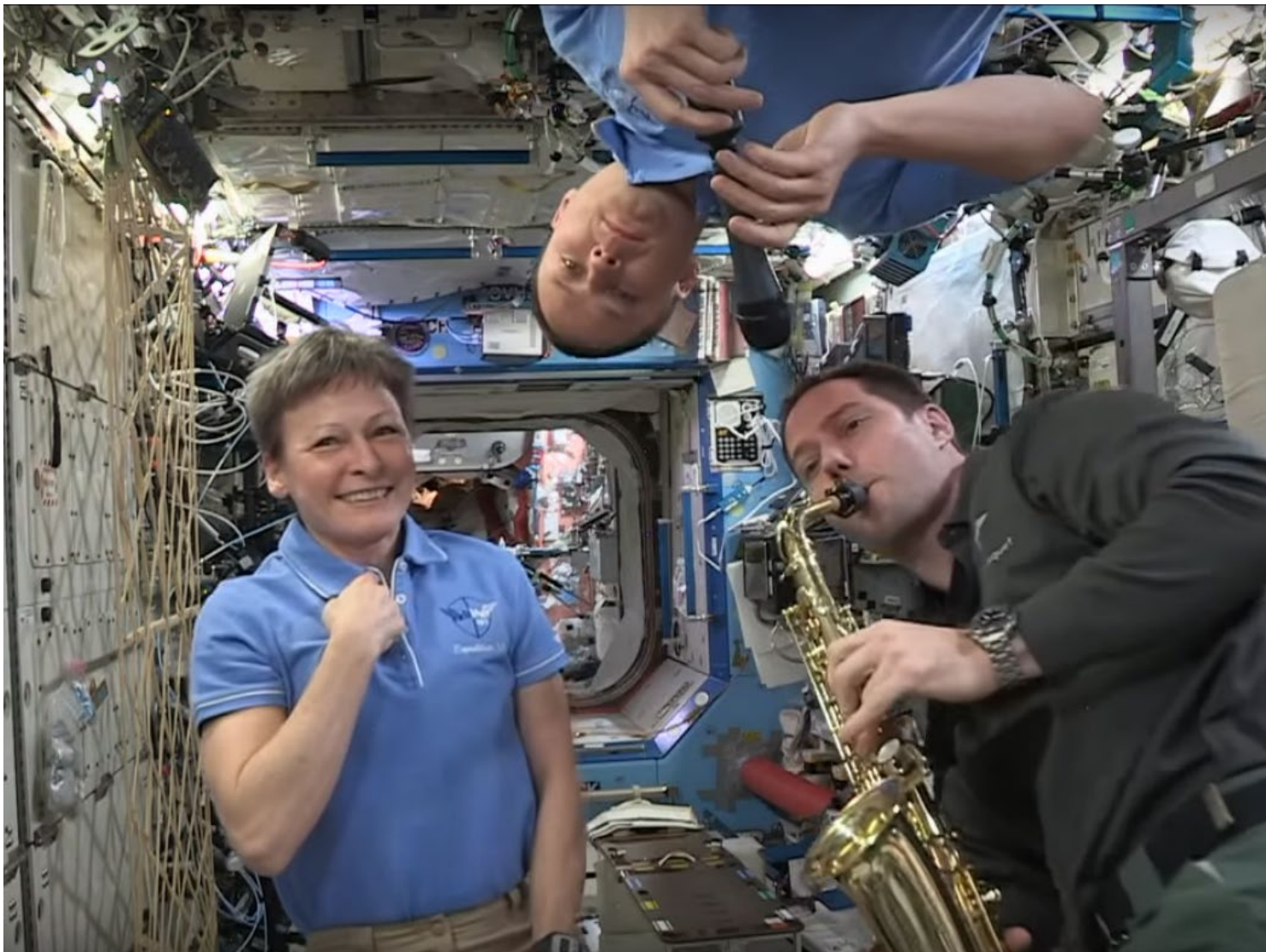
Astronauts Peggy Whitson, Jack Fischer, and Thomas Pesquet (left to right) aboard the International Space Station.